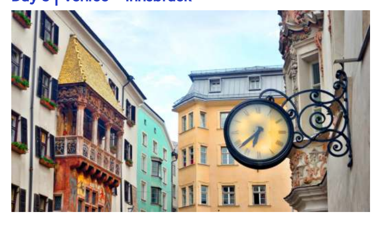
Day 9 | Venice - Innsbruck

Today you continue along the Inn Valley to the Austrian Tyrol and its capital, Innsbruck, where you can 'ooh and aah' at the impressive ski jump and view the famed Golden Roof, constructed from 2,657 copper tiles. Admire the fascinating crystal installations and browse for precious gifts and souvenirs at the Swarovski Crystal Worlds Store. This evening, an Optional Experience could see you enjoy a lively evening of entertainment during a traditional Tyrolean evening.