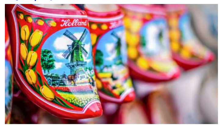
Day 12 | Depart Amsterdam

Say farewell to your Travel Director and travelling companions at the end of an amazing holiday.