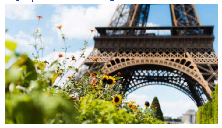
Day 3 | Paris - Lucerne Region

Journey through the idyllic French countryside before arriving in Lake Lucerne. You'll want to put the 'heart' of Switzerland in your pocket and take its history, culture and epic landscapes with you.