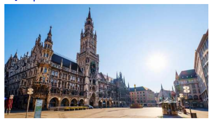
Day 10 | Innsbruck - Munich - Rhineland

Your first stop today is Munich where you can admire the Glockenspiel in the Marienplatz and the Hofbräuhaus. Continue onto the main cultural centre of the Rhineland.