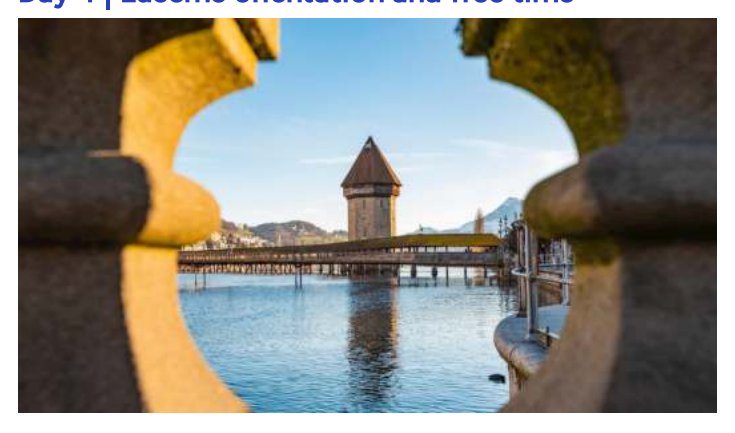
Day 4 | Lucerne orientation and free time

Turn the page to a land of fairy-tale landscapes and medieval history. You have a full day to see the sights and explore Lucerne, starting with a morning orientation including the Chapel Bridge and the Jesuit Church. No visit to Lucerne is complete without a visit to the Lion Monument, built to commemorate the brave Swiss Guards who died defending Louis XVI during the French Revolution. You may be tempted to do some souvenir shopping, but an Optional Experience into the mountains will be hard to resist. Ascend Mount Pilatus by a cog-wheel railway then embark on a scenic lake cruise