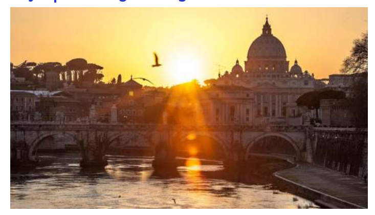
Day 7 | Rome Sightseeing and Free Time

You could spend a lifetime exploring Rome and just scratch the surface, but with your Local Specialist on hand you'll dive right into the city's heart and soul. Head to Vatican City to watch the pigeons and people tread on holy ground, then visit St. Peter's Basilica and see Michelangelo's priceless 'Pietà'. The rest of your day is free to explore the City, this evening why not consider an optional dinner at one of the local restaurants.