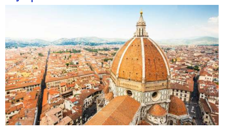
Day 5 | Lucerne - Florence

Your journey heads south to the city of Florence - home to various masterpieces of Renaissance architecture and outstanding fine arts. Enjoy dinner with your fellow travellers tonight as you prepare to soak up the beauty of the city, surrounded by Tuscan hills, that has remained unchanged throughout the centuries.